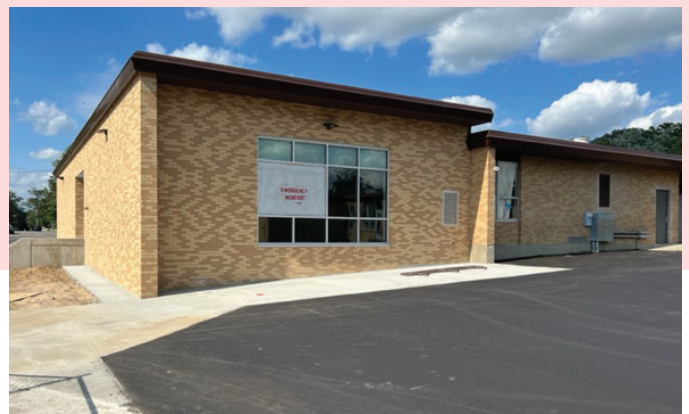
New Meadowlawn classroom