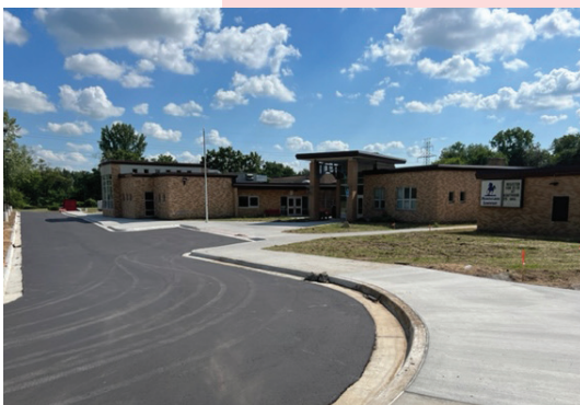
New Meadowlawn parking lot

A project to support the Culinary Arts program at East Kentwood High School as part of the Career Tech Ed Program will also be initiated, including both a restaurant production kitchen as well as a residential kitchen. Construction is also scheduled to begin on a 45,000 square foot new Early Childhood Center in the district located near Townline Elementary.