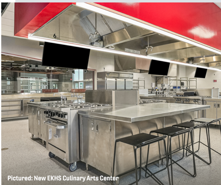
Pictured: New EKHS Culinary Arts Center